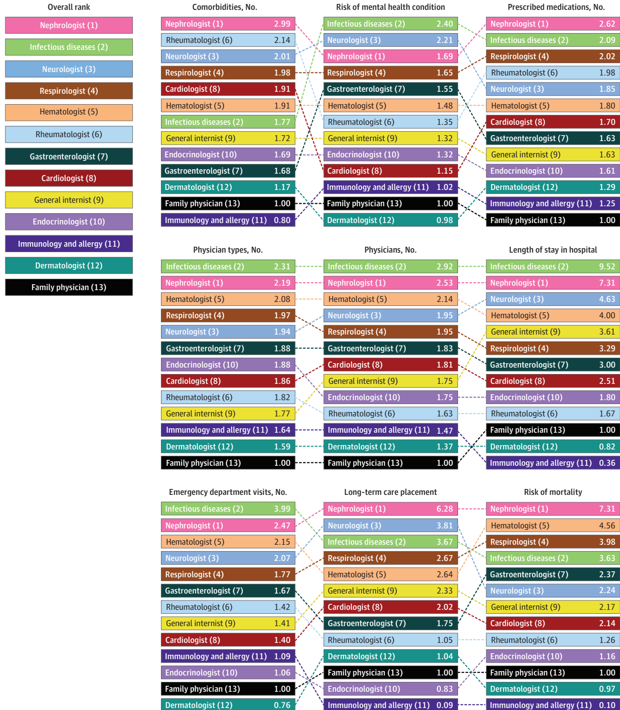
Figure 2. Complexity Rankings by Physician Type

Using results from the regressions, the specialties were uniformly ranked for each marker of complexity. The ranks then were summed across complexities giving an overall